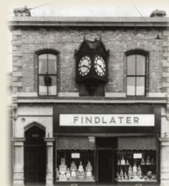
FINDLATER & Co