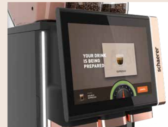
The digital manometer controls in real-time the brewing pressure.

The stainless steel finishing, the brass trimmings and a choice of colours for the casing, which can be further customised with personalised branding, make it the ideal machine to be displayed in full view of the public.